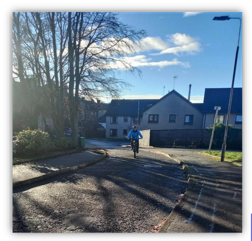
Picture: Wullie using one of our e-bikes that we purchased following funding from Transport Scotland and Energy Saving Trust in 2022